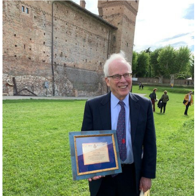
Charles Maier received the Premio Nazionale Cherasco Storia “Gianni Perona” alla carriera in recognition of his distinguished career. Professor Maier was awarded the prize at a ceremony in Italy on May 10th, 2019.