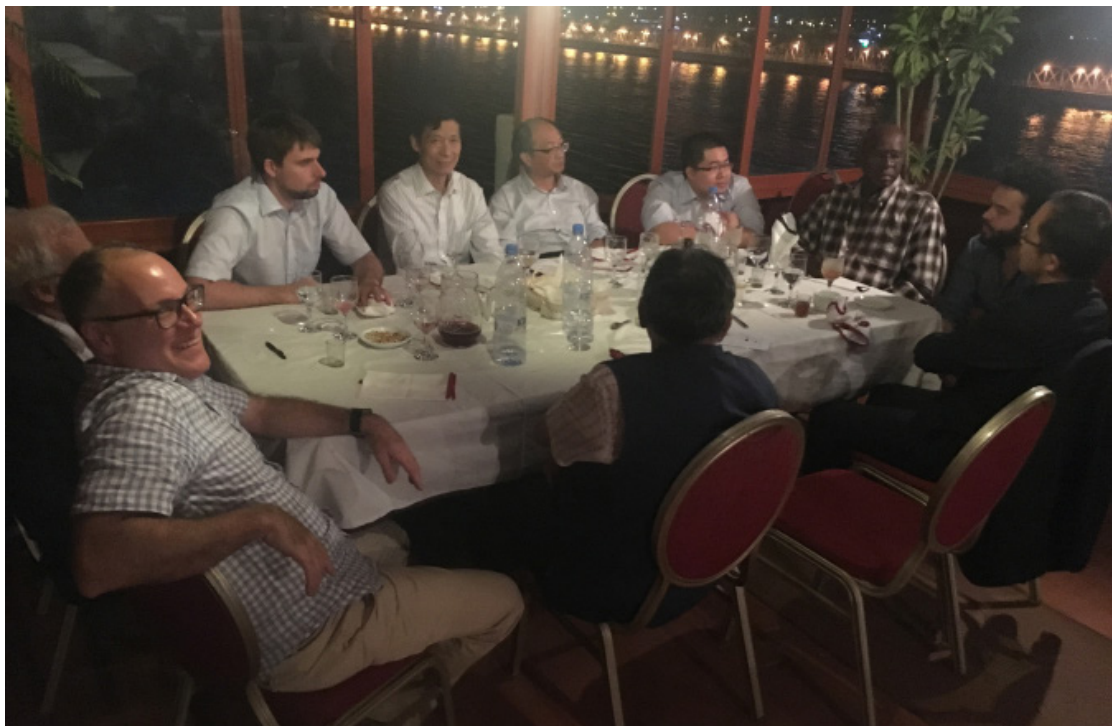
Right Network partners' meeting.

This is, perhaps, why a spatial framework on global history and urbanization emerged as a fundamental theme throughout the conference. There is much scholarly promise in linking micro-historical studies of colonial cities to broader global history, just as broader dimensions of society, politics, and economics can be utilized to better comprehend 'local' experiences. It is within these different temporal and